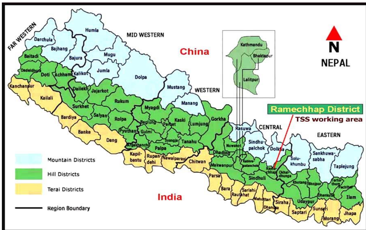
Figure 2: Map of Nepal with Ecological Regions (Manthali Savings and Credit Cooperative Society, 2012)

milk and water buffalo meat. In addition, the agricultural labor force is comprised of 75% of Nepal's population (CIA, 2015). However, declining agricultural production in Nepal has depressed rural economies and increased widespread hunger and urban migration (USAID, 2015). Nearly 50% of Nepal's population is undernourished and almost half of all children under five are chronically malnourished as well (USAID, 2015). Figure 2 illustrates the geographical region of Nepal and Figure 3 illustrates the different levels of poverty severity throughout Nepal.