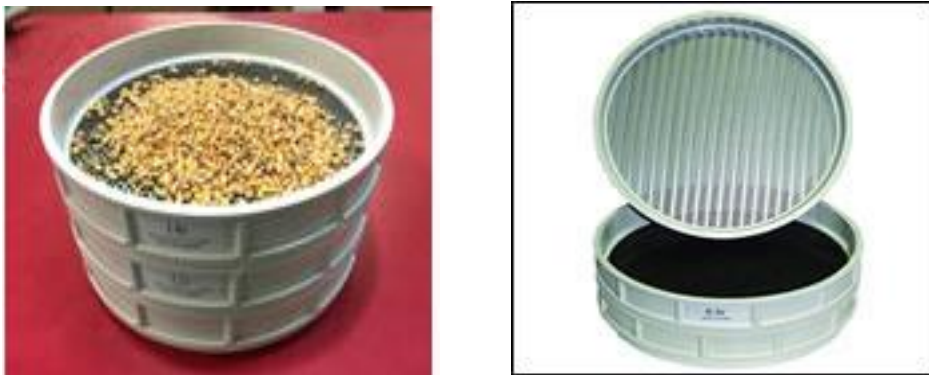
Figure 1: Corn and Cereal Sieve Set (Labtronics, 2015)

For the purpose of exporting these products to Nepal, it is more convenient to export the sieves in these “sets” listed in Table 1. Furthermore, this will also improve shipping costs, for example, instead of shipping the many sieves under each “hole” category; it will be easier to ship six “sets” of sieves, which come equipped with every item needed for the process of sieving. By doing this, local Nepalese farmers will only have to know what type of seed they are looking to sieve, and will not have to know specific hole sizes, which may be complex. This will make the purchasing process a lot easier for subsistence farmers in Nepal. For example, Table 2 lists sizing and pricing for slotted sieves, from this table, it can be seen that choosing a sieve by this process may be difficult for a Nepalese farmer as there are many measurements to consider. Therefore the product that will be exported from Canada to Nepal is the six different sieve sets manufactured by Dimo’s Labtronics as an alternative to exporting their sieves separately.