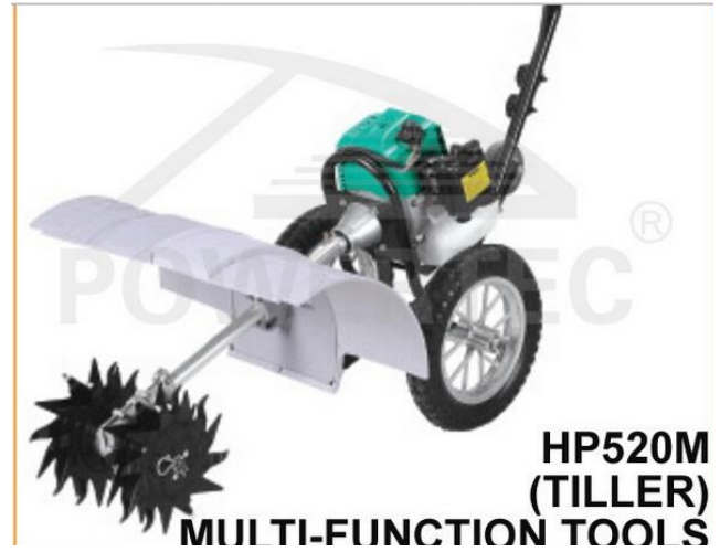
HP520M (TILLER) MULTI-FUNCTION TOOLS