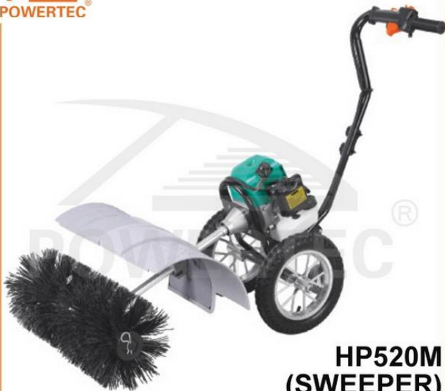
HP520M (SWEEPER) MULTI-FUNCTION TOOLS