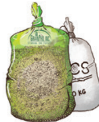
Super Grain Bag