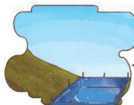
Water Harvest Pond