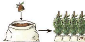
Yam in Sack