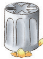
Hand Held Corn Sheller