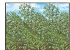
Ginger and Soyabean Intercropping