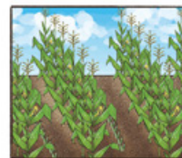
Maize and Ginger Intercropping